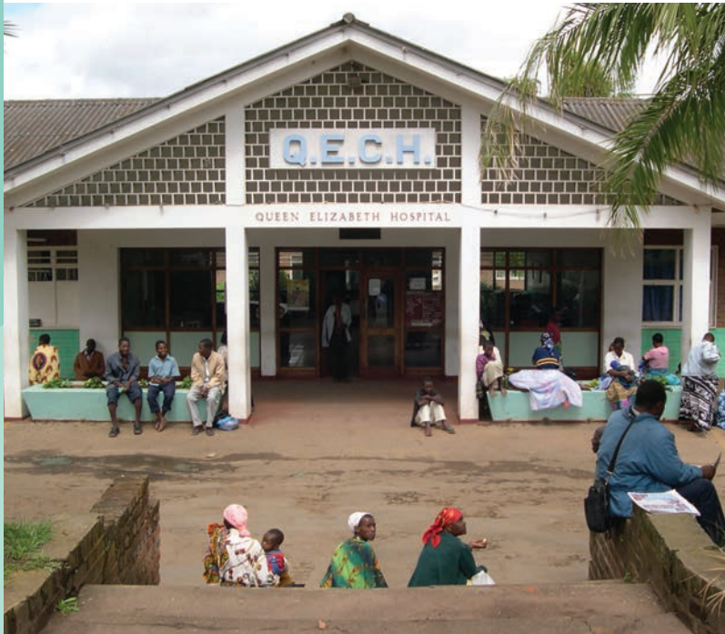
Photo Above: Physicians for Peace in Malawi. Cover Photo: Physicians for Peace in Dominican Republic.